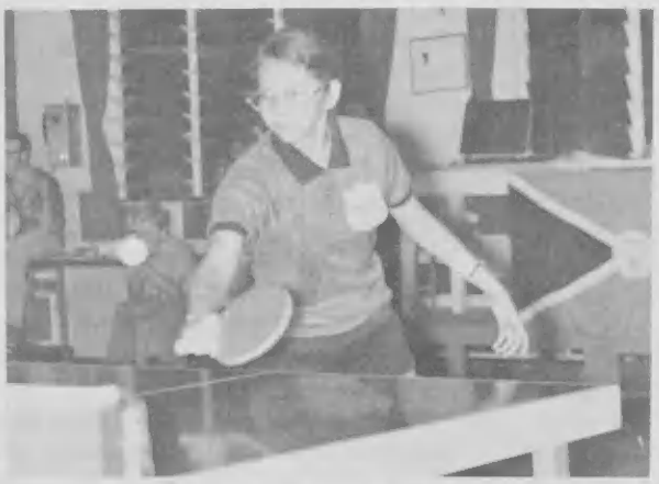
Table tennis at Estrella Club